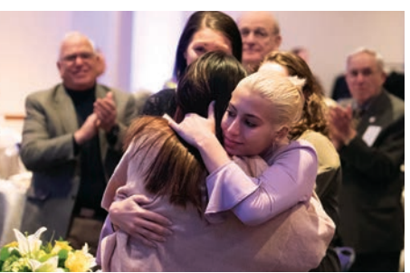
Scholarship donors and recipients at the annual Scholarship Appreciation Reception in April 2018