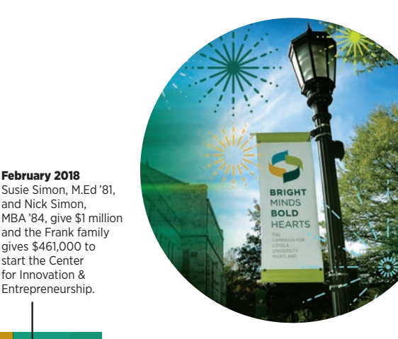
April 2017 An anonymous donor makes a planned gift of $3.4 million.

Bright Minds, Bold Hearts campaign closes as it exceeds its $100 million goal.