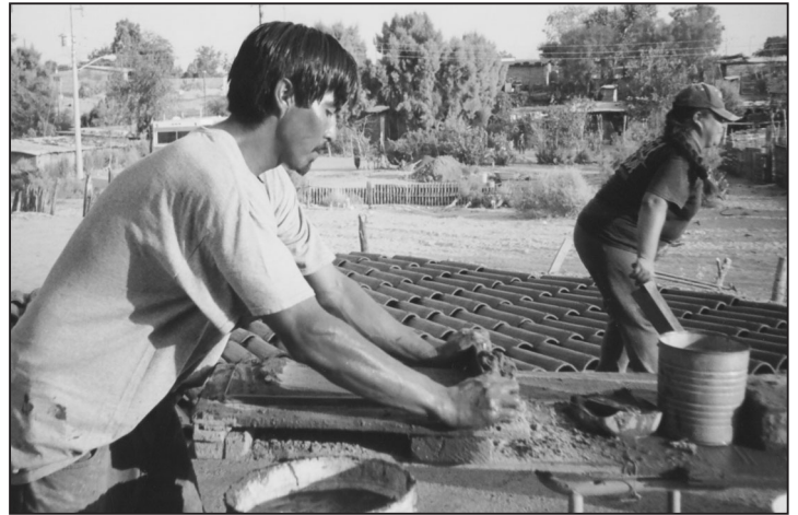
This family of tile workers makes 2000 roof tiles a week for $150 income.

pus-wide effort for financial support that has enabled Project Mexico to thrive for over a decade.