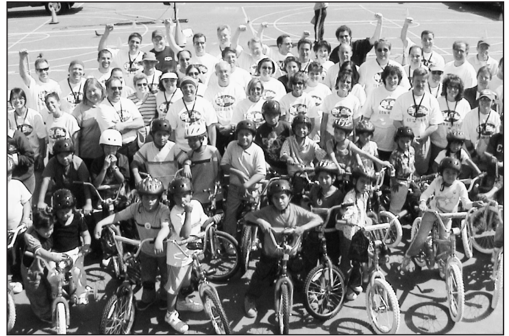
Pfizer volunteers and Sherman students celebrate teamwork!

organic gardens, or participate in construction of schools and community facilities in underprivileged neighborhoods. Los Niños VolunTours™ also works with other area non-profits such as the San Diego Children's Museum/ Museo de los Niños to provide a broad range of volunteer oppor-