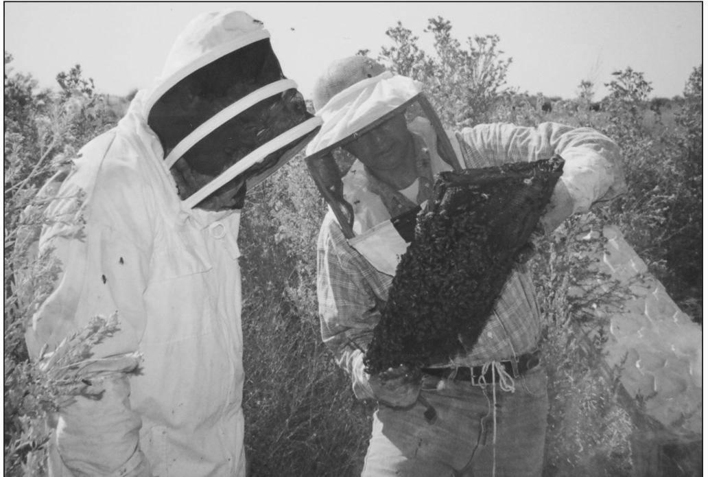
A visit to the bees in Mexicali—110° outside!

From Mexicali, the program director and four promotoras participated in the opening workshop and are interested in beginning immediately. In our pilot loan project, Mexicali had six loans. The first, a