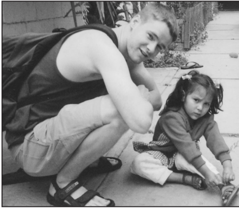
Who is teaching who?

here in our border region during the Fourth Annual Bi-Cultural Event. From June 19-24th, volunteers worked side by side with community members in Tijuana, Mexico to learn about the culture, practice Spanish, and complete community projects.