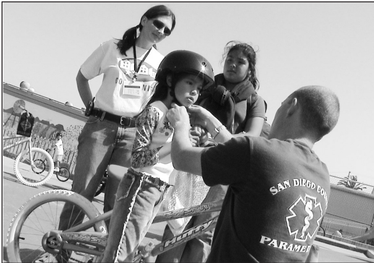
Paramedic assists child in fitting her bike helmet.

Los Niños VolunTours™ creates custom-designed half-day, full-day, or weekend volunteer programs for travelers interested in giving back, but not giving up their vacations. Supporting human development, education, nutrition, and self-sustainability for women and children in the San Diego/Tijuana Border region, Los Niños invites visitors to prepare meals for school children, build