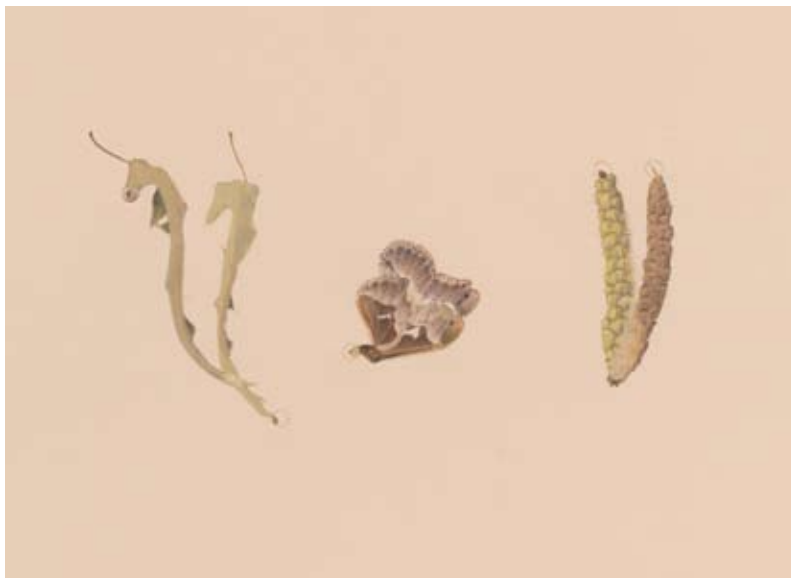
Once & Later. Detail. 2010. Colored pencil on paper. 30 x 22 inches.

Artists Talk / Reception: Thursday, October 28, 5pm – 7pm