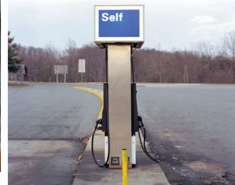
Left. From Within The Biography of Catastrophe #4. 2010. Medium. 12 x 15 inches.