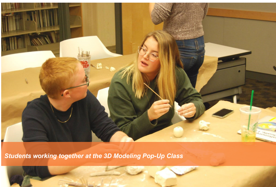
Students working together at the 3D Modeling Pop-Up Class