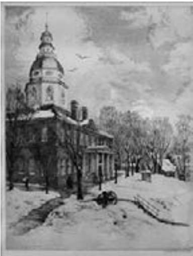
Gabrielle de Veaux Clements The State House: Annapolis, Maryland (A Day in January, 1928) Etching 1928 18" X 13 1/2"