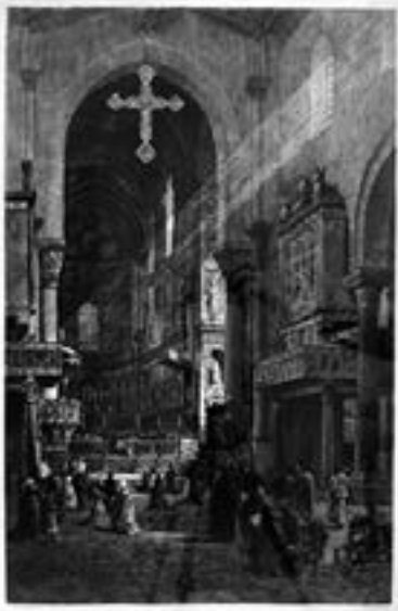
Axel Haig Cathedral Cefalù Etching 1901