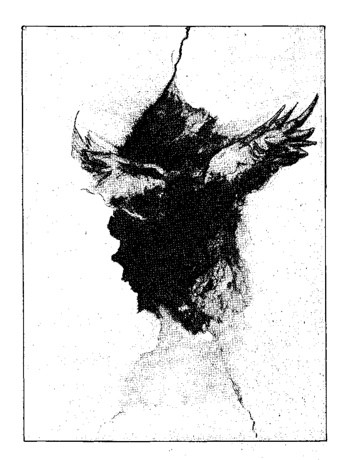
FORUM Spring 1987