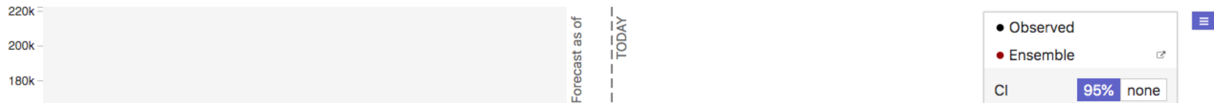
Observed and forecasted cumulative COVID-19 deaths in the United States