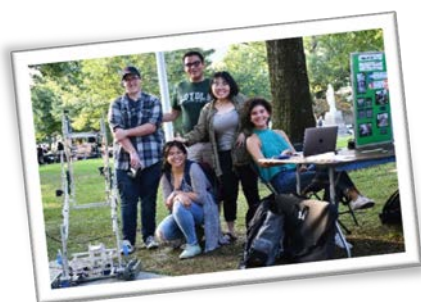
Loyola's Robotics Team at the fall student activities fair... one of many innovative student clubs on campus. Click here for a complete list of clubs and organizations.