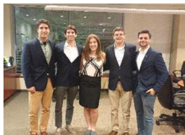
BAJA team following their presentation to the NASSB on Oct. 1.