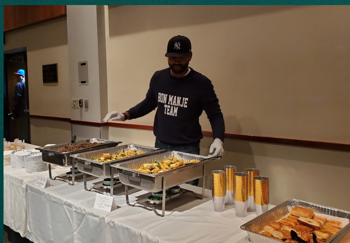
French Week: Celebrating Créolité