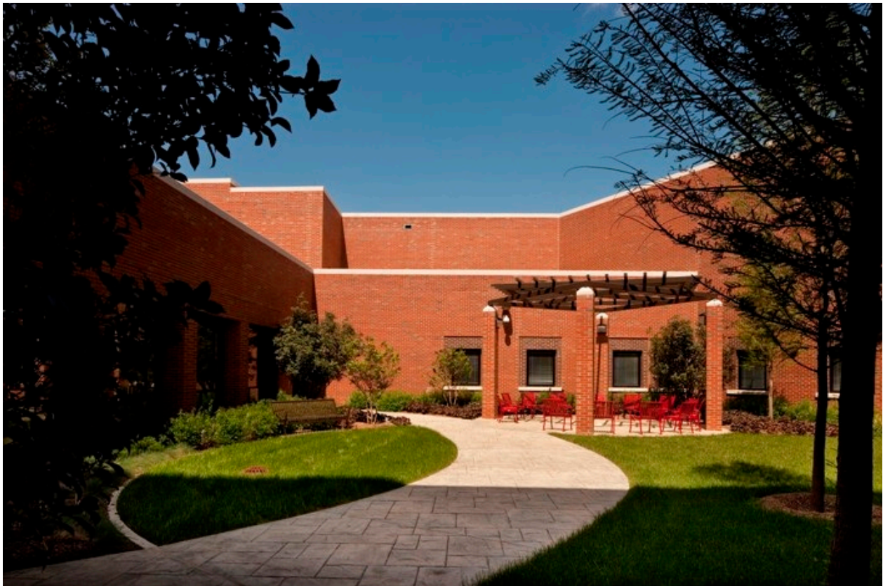
One of four courtyards for outdoor groups and therapy

The Transitional TLC provides treatment for individuals who are preparing to reenter the community. Within the Transitional TLC groups, individuals in care present with a full range of severe psychiatric conditions. Individuals in care in the Transitional services program receive a variety of therapeutic services, including participation in specialty groups such as ACT, DBT, Coping Skills, and Anger Management. Group services are also provided on the in the milieu on all Intensive and some Transitional units at various times during the day, and group topics are developed based on the needs of the individuals residing on each unit.